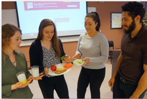
NMSU Dietetic Internship Alumni