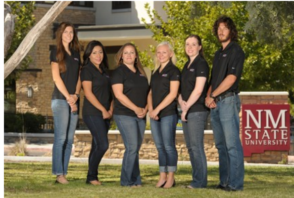
NMSU Dietetic Internship Class of 2015-2017

Clinical (16 weeks total) Community (16 weeks total) Foodservice (10 weeks total)